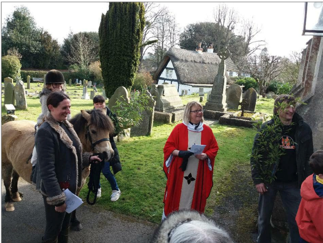
The Palm Sunday Procession arriving at the church door