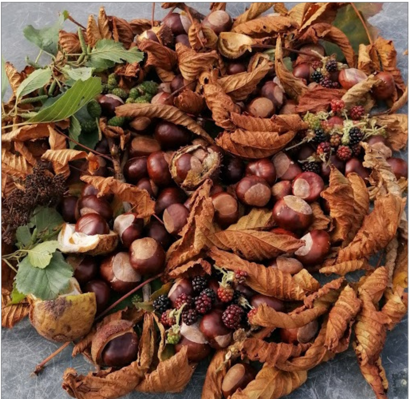
Autumn fruits (Look closely at the conker shell in the centre - see page 8)